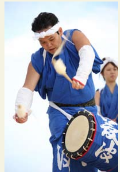
Jangara Nenbutsu Odori/ Suganami Seinenkan (Taira, Iwaki City, Fukushima)