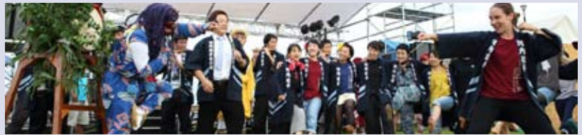
Hamakawachi Onidaiko from Sado Island Performing Arts (Maehama style demon dance, Hatano)