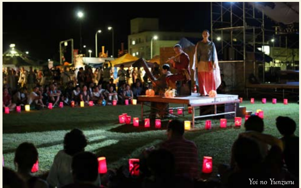
Yoi no Yunzuru

The morning after begins the clean-up, interrupted temporarily by the departure of most visitors on the morning ferry. Kodo and Sado Islanders are out in force to bid farewell to our guests from the dockside where a thousand strands of colourful tape are thrown down from the ship as it pulls way to the sound of taiko and flute, which carries on till the ship is just out of sight. We on the dockside then raise our voices in a collective shout of 'COME BACK AGAIN!' And then we who remain – and our guests who have gone – return to our quieter, less-heartily celebrated lives.