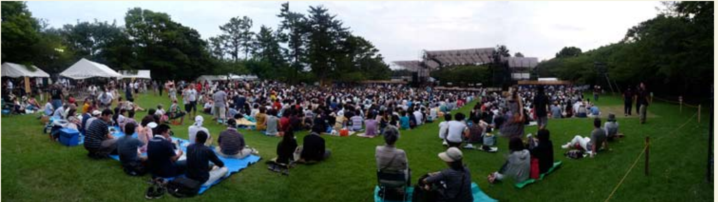
The natural hilltop amphitheatre setting unique to the Shiroyama Concerts at Earth Celebration