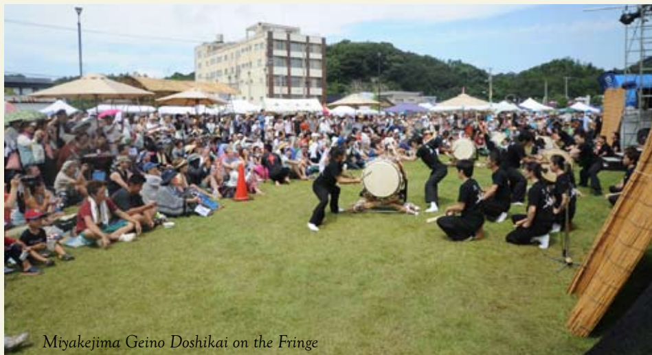
Miyakejima Geino Doshikai on the Fringe

Mother Nature was toying with me. Not an hour after I had arrived on the site in Ogi the deluge began. Biblically. And that pretty much encapsulates the first day. Though the workshops carried on at various indoor venues, the outside Fringe events were washed out, as was my camera and everything I wore. Fortunately the rain slackened somewhat as the evening performance