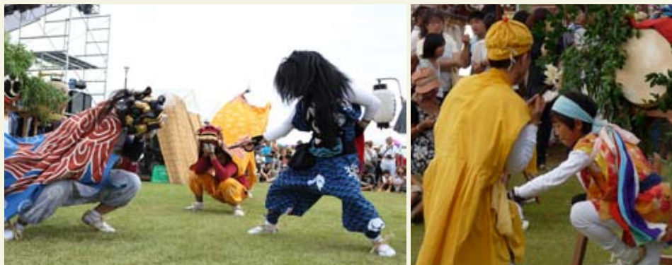
Left: Niibo Chuo Seinenkai from Sado Island Performing Arts (Katagami-style demon dance, Niibo) Right: A young local upholding Sado's traditional onidaiko (demon drumming)

approached. Kodo and the audience soldiered on bravely with only intermittent rain during the concert and a memorable time was enjoyed by all (especially the fellow selling plastic raincoats to the visitors as they headed up Shiroyama mountain). My friend selling kakigori in the Harbour Market did less well, her total sales of the shaved ice treat for the day? Zero.