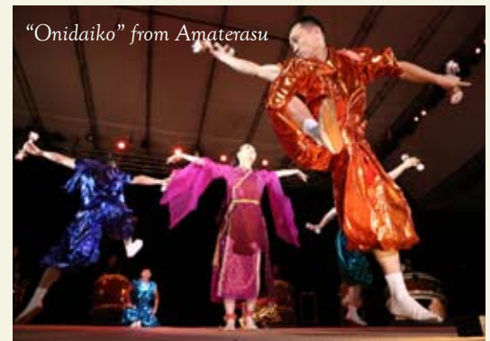
"Onidaiko" from Amaterasu