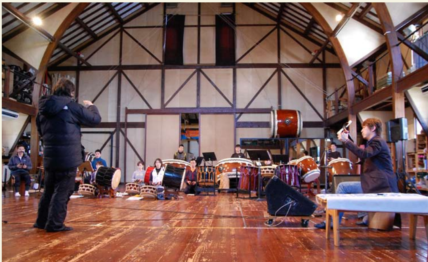
Rehearsals at Kodo Village for the 2013 collaborations

Earth Celebration 2013 will be held August 23-25 on Sado Island, Niigata. For further details, please visit the EC website .