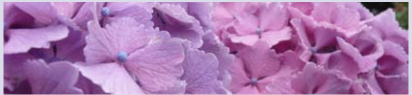
Hydrangeas, Kuninaka Plain, Sado Island