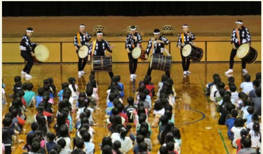
Kodo School Workshop Performances in Spring 2013.

Kodo One Earth Tour 2013: Legend finished its year-long domestic tour in Asakusa, Tokyo, on June 9 with a performance that was broadcast live worldwide via Ustream.