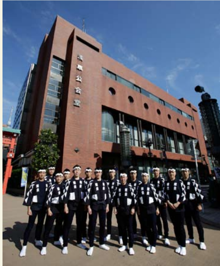
The cast of the final Japan tour of "Kodo One Earth Tour 2013: Legend" outside Asakusa Public Hall in Tokyo

This month, we look forward to welcoming tour groups and visitors from around the island and afar to our Special Performances on Sado Island . Last year, we held these concerts in three seasons, but this year there are just two sessions, in spring and summer. So this is your last chance in 2013 to see our distinguished members perform in historic Shukunegi, up-close and at home in the charming Shukunegi Community