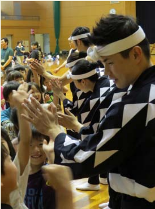
The school tour cast bids farewell to an energized audience after one of their twice-daily performances

Kodo One Earth Tour 2013: Legend finished its year-long domestic tour in Asakusa, Tokyo, on June 9 with a performance that was broadcast live worldwide via Ustream.