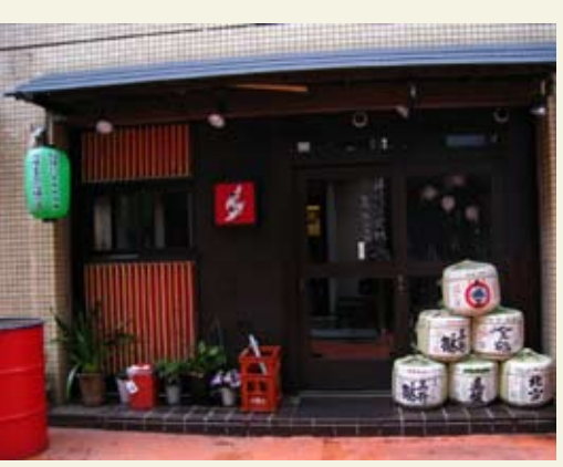
For your post-concert meal in Asakusa, enjoy a taste of Brazil at Que Bom (left) or a taste of Sado Island at "Datcha" (right)

You can purchase special coupons with your concert tickets for meals in Asakusa or visits to Tokyo Skytree. If you already have your concert ticket, you can purchase just the meal coupons and Tokyo Skytree & Asakusa guided tour tickets by themselves. For details, see our website.