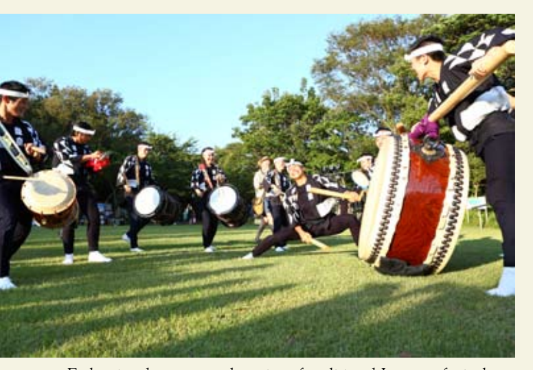
Embracing the energy and passion of traditional Japanese festivals

Details of EC 2013 will be available in mid-May on the EC website. Ticket sales and workshop applications commence June 1. Follow EC on Facebook and Twitter for updates!