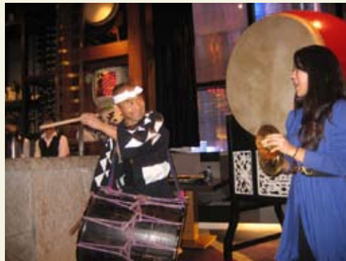
Jamming with a patron at Beijing restaurant “Hatsune”