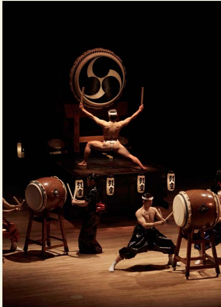
Tamasaburo Bando's first work as Kodo Artistic Director is "Kodo One Earth Tour: Legend"