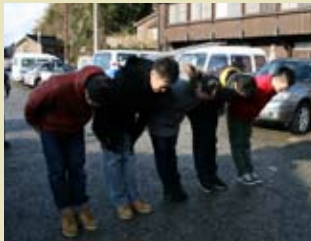
New members greet the Kodo group in early January