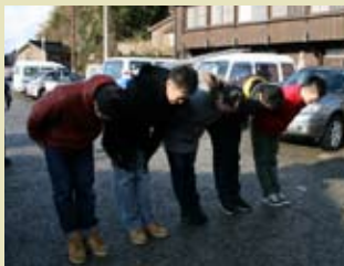
New members greet the Kodo group in early January

All five just made their foreign debut in Las Vegas on the current USA tour Kodo One Earth Tour 2013: Legend . Four of them had to get their first passport made especially for the occasion, so they were nervous and excited just to get on the plane. We hope everyone who comes along in the USA will cheer them on, and we look forward to everyone's support of this new generation in the years to come.