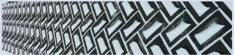
Traditional block wall on a winter's day