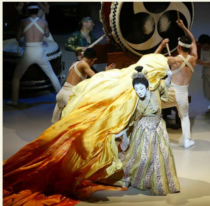
Tamasaburo Bando & Kodo in "Amaterasu" (2006 season)