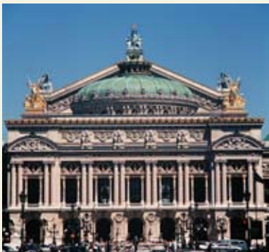
Palais Garnier, Paris

This month, two Kodo casts are performing abroad. Kodo One Earth Tour 2013: Legend is on tour in the