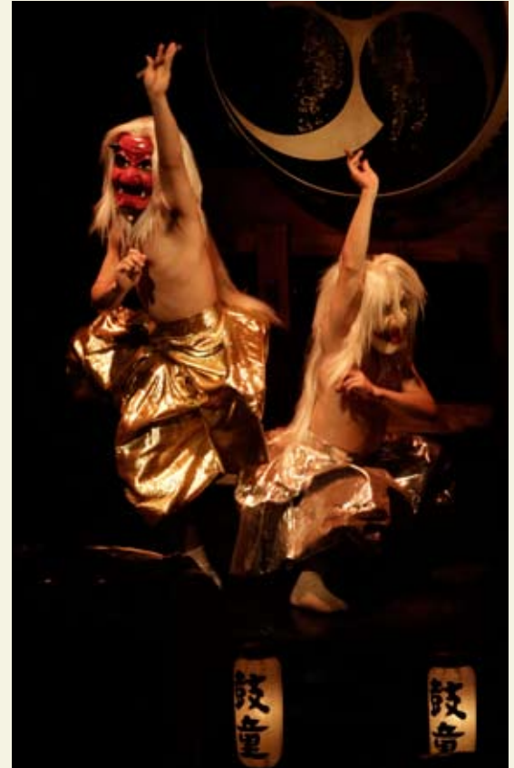
"Onidaiko" (Kodo One Earth Tour 2013: Legend)

Kodo performers made history on February 1st when we became the first taiko players to perform at Palais Garnier, the world's highest-ranked theater and home of the Paris Opera. This month, Kodo is taking part in ballet performances of " Kaguyahime " held by France's leading opera and ballet ensemble, Opéra national de Paris. We hope you will join us at this very special venue for these