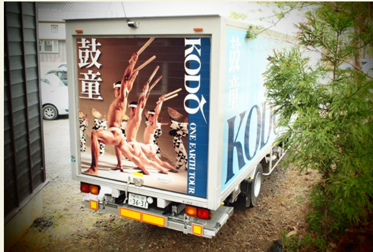
Our trucks have been adorned with new team "outfits" for 2012 and are ready for touring