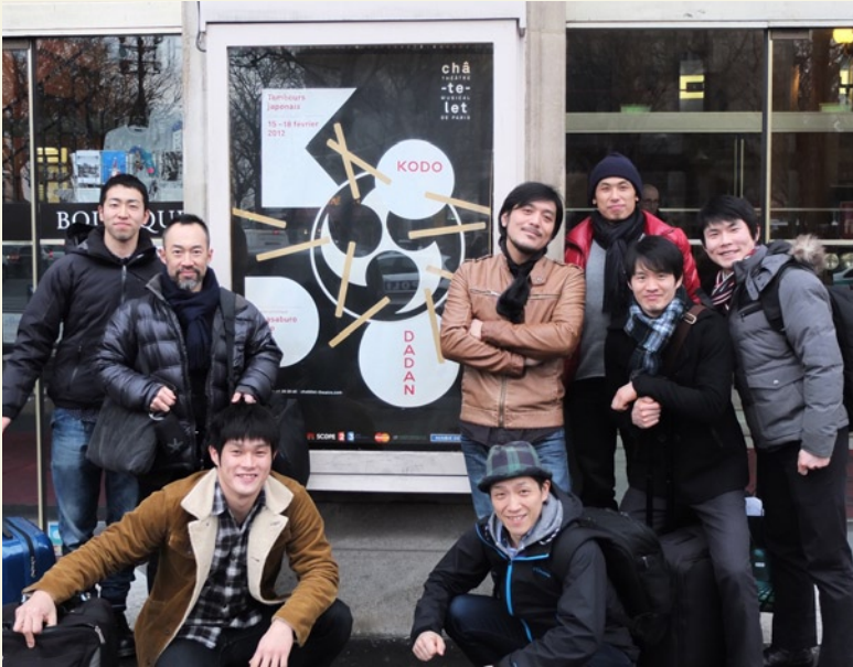
The cast of Dadan on arrival in Paris, outside Théâtre du Châtelet