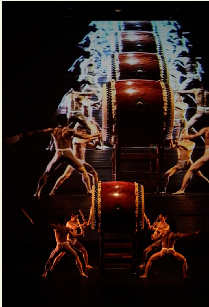
Kodo "Dadan" Concerts at Théâtre du Châtelet, Paris

To all our readers in Japan, and those planning to visit this summer: we hope you'll join the Dadan cast for their domestic tour in July , and also a special performance at Earth Celebration