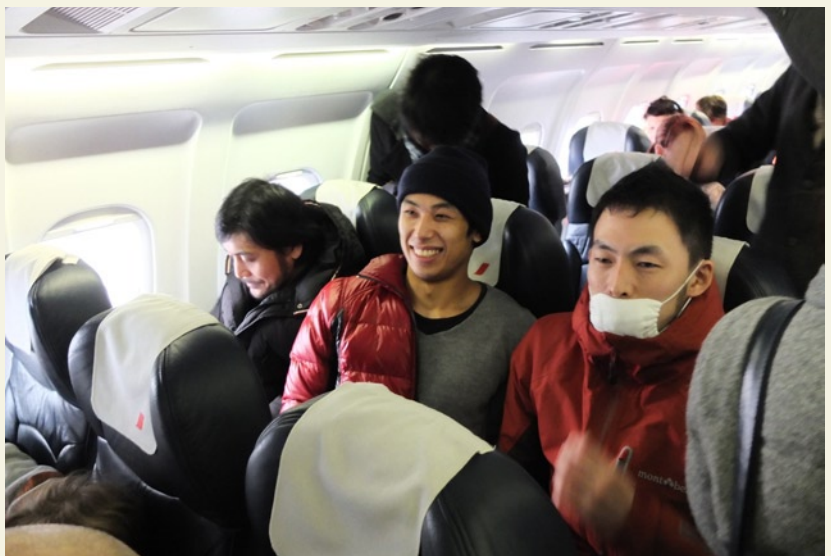
Ready to fly from Dublin to Paris