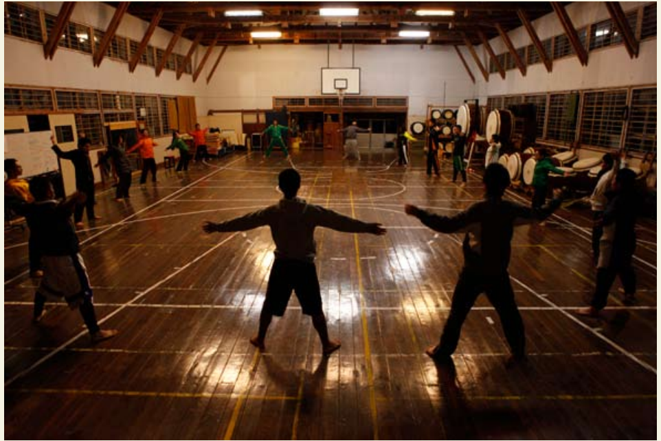
Kodo Apprentices get up before dawn daily to exercise, clean, and prepare for each day of their training

like shamisen, koto and kokyū. They learn basic culinary skills such as the filleting of fish, cook for themselves and grow their own rice and vegetables.