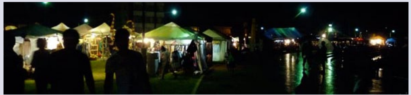
Ogi's once-a-year bustling Harbour Market by night