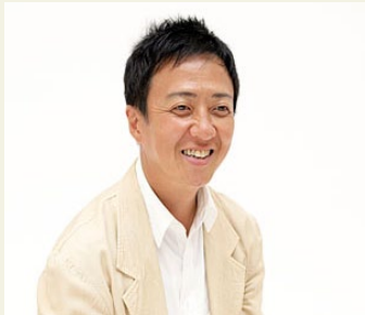
Tamasaburo Bando, Kodo's new artistic director

Please click here to read a message from newly appointed Artistic Director Tamasaburo Bando