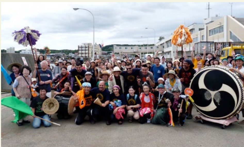
Group portrait at the end of the dock after a Kodo-style farewell

For those who want to participate in EC in a more active way there are plenty of workshops to participate in, from the perennially popular O-daiko workshop to learning how to make a bamboo flute or basket, and the list goes on. If you want to participate