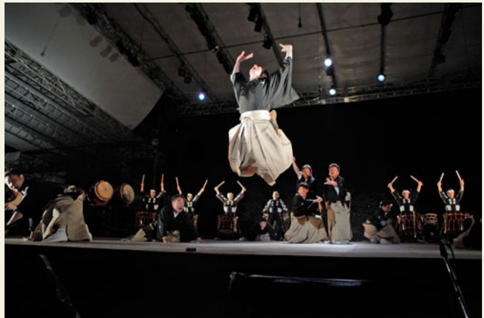
Japanese dance ensemble KO no kai performs "Onbashira" with Kodo live for the first time