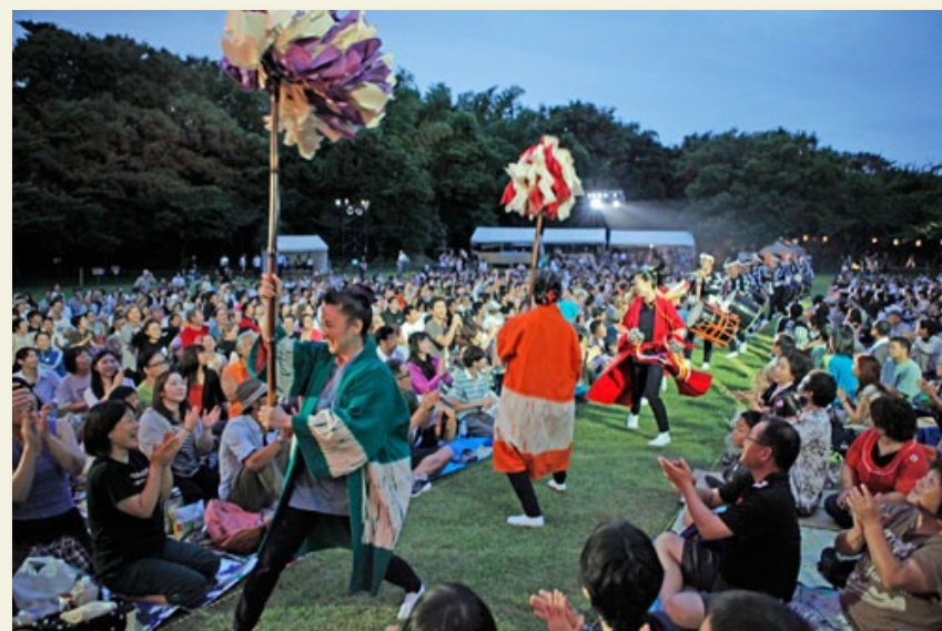
The fresh energy gathered at Earth Celebration fuels the One Earth Tour