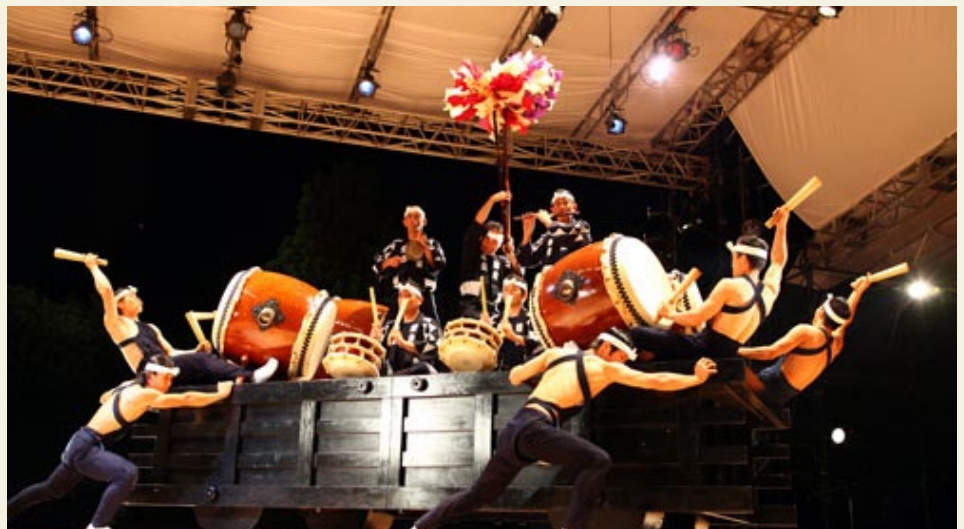
Kodo takes "Yatai-bayashi" back to its festival roots by performing it to lively cheers on a moving drum cart