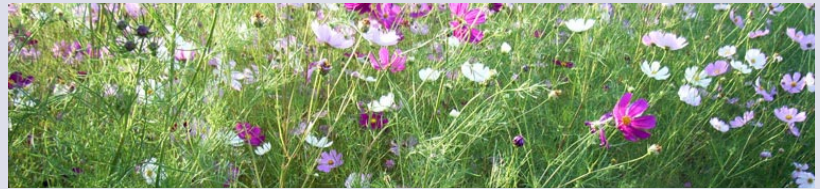
Summer wildflowers near Kodo Village