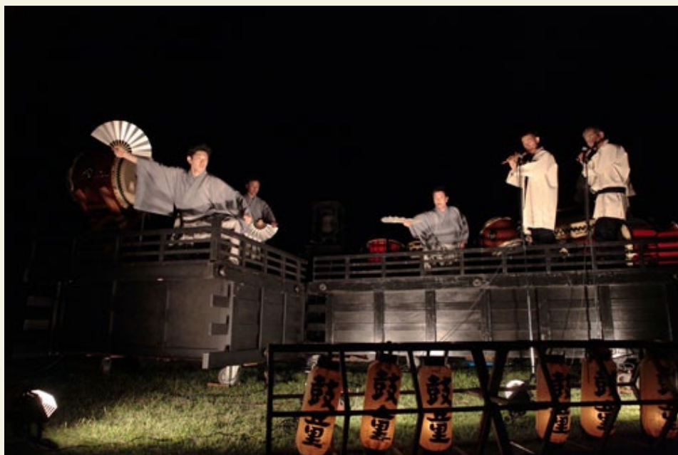
The festival doesn't end after the concert each night. The stamina of Kodo's members is hard to fathom. Here they are performing with KO no kai. MM

We hope you'll enjoy Maiko (MM) and Buntaro's (BT) unique perspectives on Earth Celebration 2011.