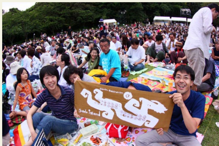
Smiling festival goers, full of fabulous energy. MM