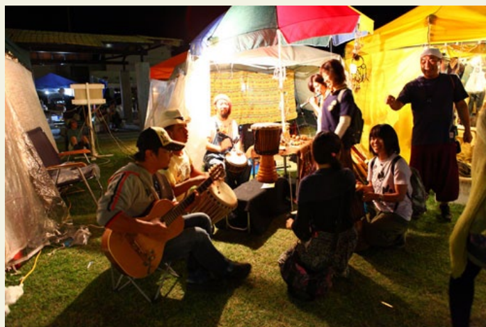
At the Harbour Market, performances start up all of a sudden. And people show up out of nowhere to watch. MM