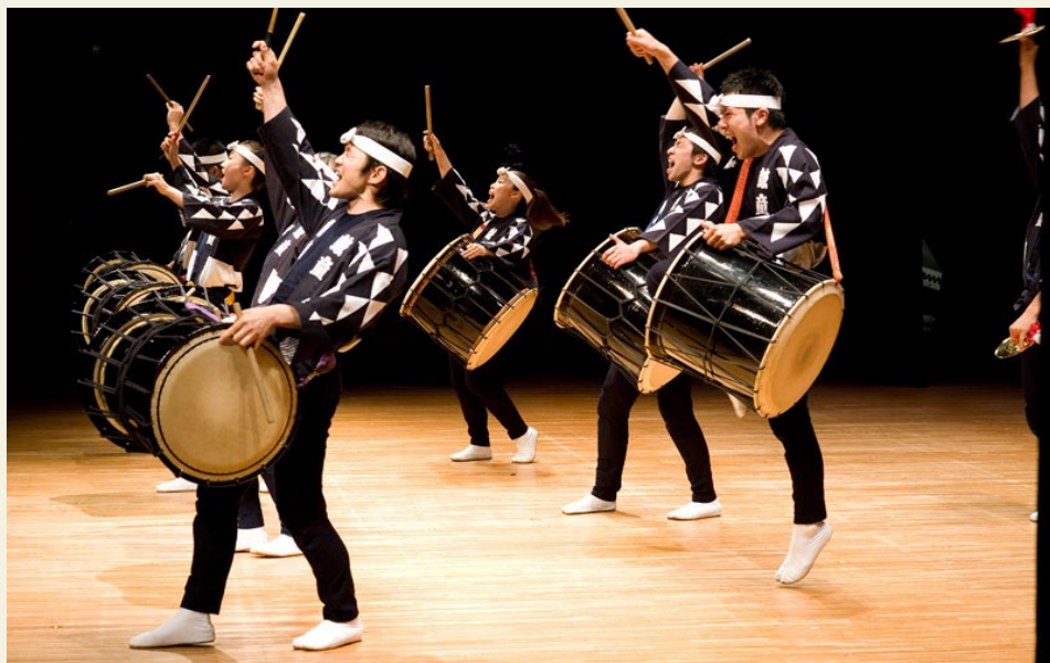
Touring Japan with upbeat "Stride"

100 years since the birth of Taro Okamoto, Kodo, who deeply shares Okamoto's passion towards the arts and the creative world, expresses the energy felt throughout one's body and soul when facing the taiko head-on in its latest piece "Honoka"