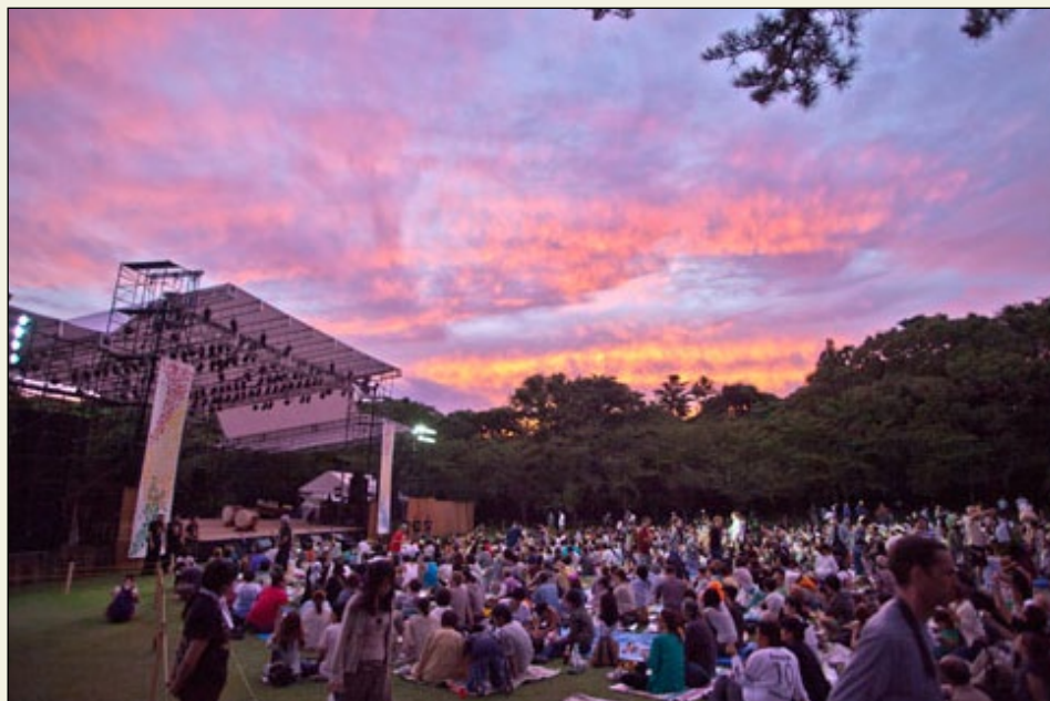
The sunset during the intermission at the Shiroyama Concert. The rain and clouds from the days prior were driven away, and the final day of EC was blessed with good weather. BT