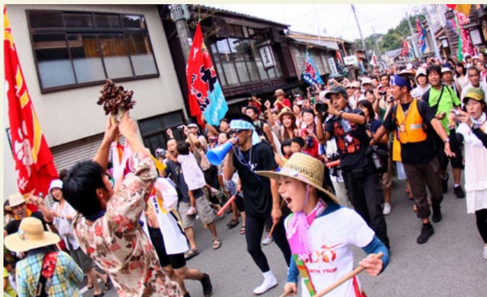
Kodo Parade fills the street of Ogi. I wonder how far back the line stretched? MM