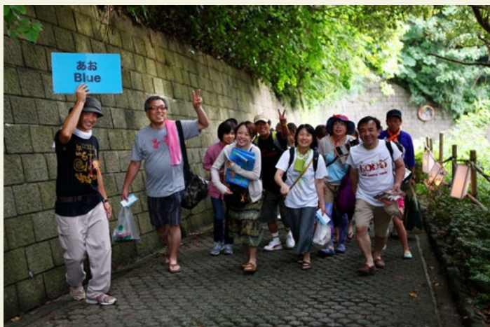
Everyone is equal as they walk up this steep road to Shiroyama Park. It's a tough hike, but carrying their picnic sheets, everyone looks like they are enjoying themselves. MM