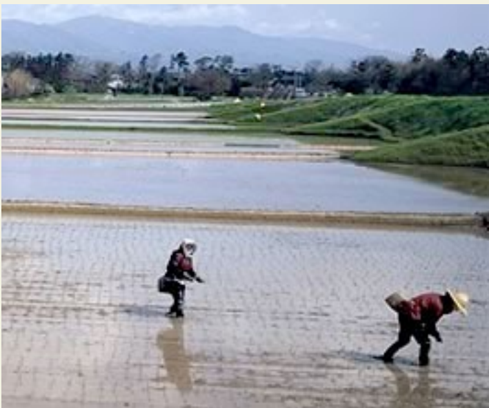
Planting rice in Kuninaka, Sado's fertile central region

In last July's issue of eNews , we described how Kodo Apprentices cultivate rice at the Kodo Apprentice Centre , and have learned about a 1000 year-old spiral rice planting style that is still practiced in the village of Kitaushima on Sado Island. This tradition, and related ceremonies, is called "Sado no Kuruma-daue", and has been designated an "Important Intangible Folk-Cultural Property". For more information, click here to download last July's issue.