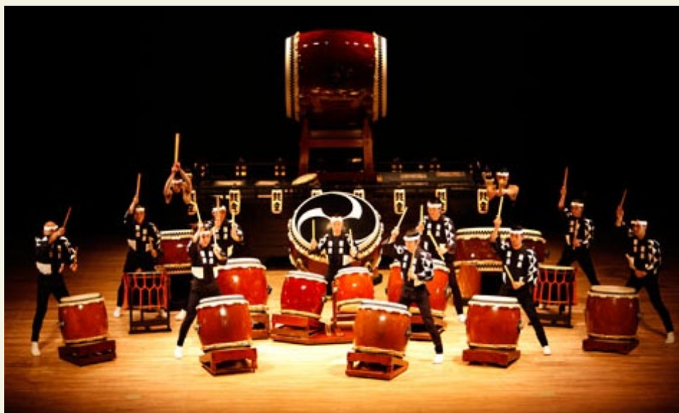
Opening number "Honoka"