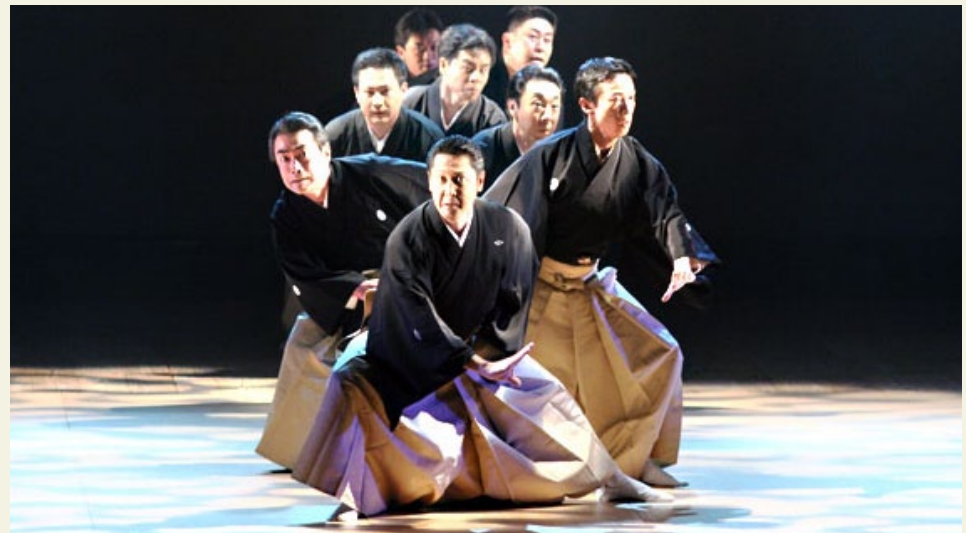
KO no kai (Japan)

With a serene beauty yet overwhelming intensity, the KO no kai dance, leap and soar to new heights of expression. The group used Kodo music for an original piece that premiered in 2000 called Onbashira , which enjoyed an overwhelming response and an unprecedented number of encore performances. This appearance at EC will mark their first live collaboration with Kodo.