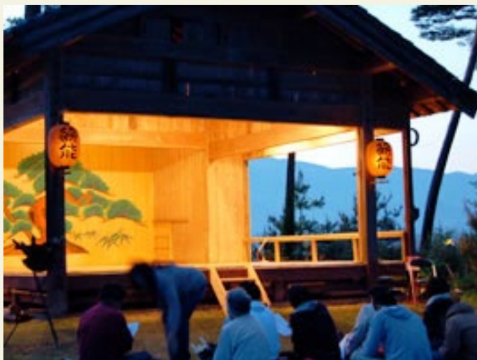
Takigi Noh stage on Sado Island