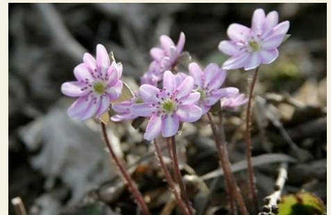
Yukiwariso (hepatica) on the Osado Skyline

Sado's cherry trees have blossomed and faded by May but up on the mountain tops of the Osado Skyline many Spring wildflowers can still be found, including katakuri (dogtooth violet) and yukiwariso (hepatica). If you take one of the buses from the Ryotsu ferry terminal up to the Skyline trails, you can hike the ridge trails and enjoy both the flowers and amazing views of the island. The highest point on Mt Kinpoku is 1172 meters,