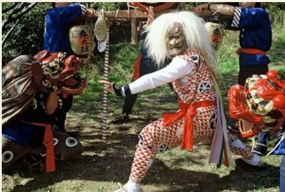
Onidaiko (demon drumming) is performed in villages throughout Sado Island every Spring to drive away evil spirits and bring good luck.

While all forms of onidaiko include masked demons dancing to a drum, many variations have developed over time. In one area in the north of Sado, for example, the onidaiko features an old man who tosses out beans as a way of sewing good luck, while in the