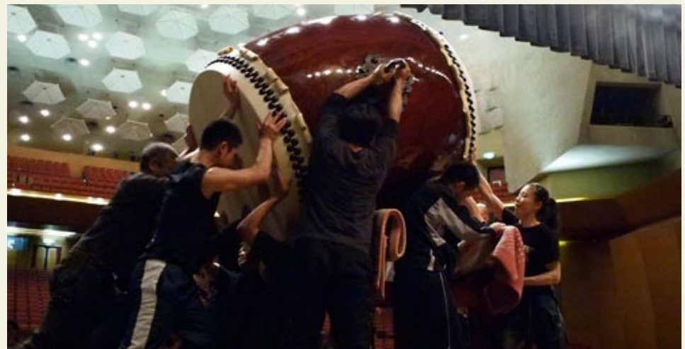
Putting the approx. 400 kilo odaiko on its stand