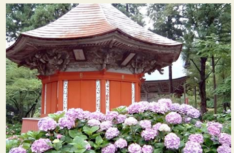
Ajisai (hydrangeas) at Rengebuji Temple

so even though it is Spring it is not unusual to discover patches of snow in some places.