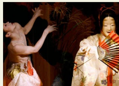
Two professional Noh and Kyogen performances with contemporary dance will be held prior to this year's Earth Celebration

Spring is also the time when Sado's many Noh theaters begin their annual season of performances, which usually run until October. As with many traditional performing arts on Sado Island, numerous variations have