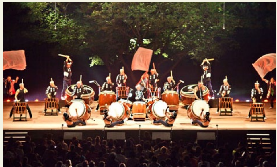
Kodo on the Shiroyama Concert stage