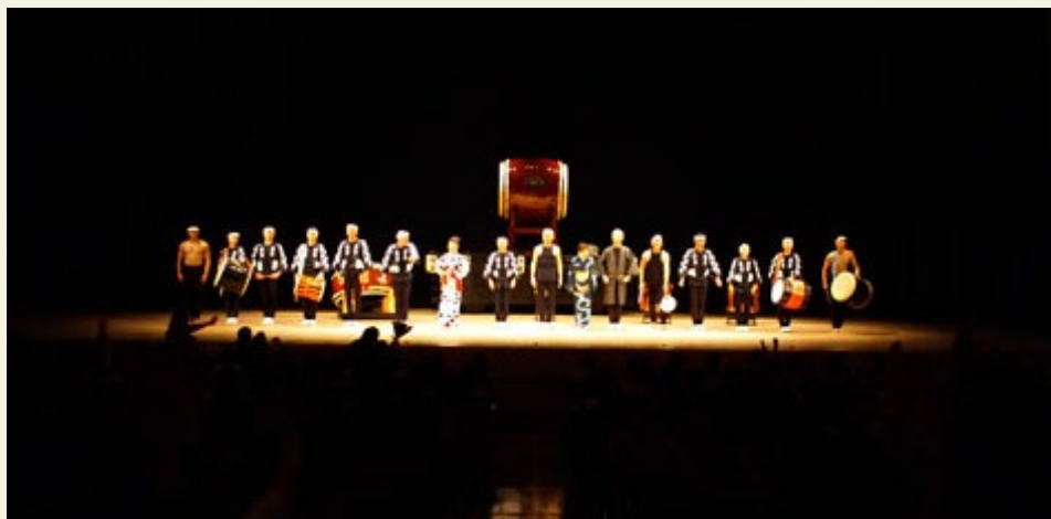
The cast of 16 thanks the audience