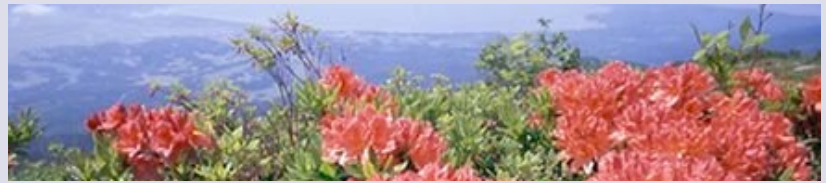
Wild azalea on the Osado Skyline