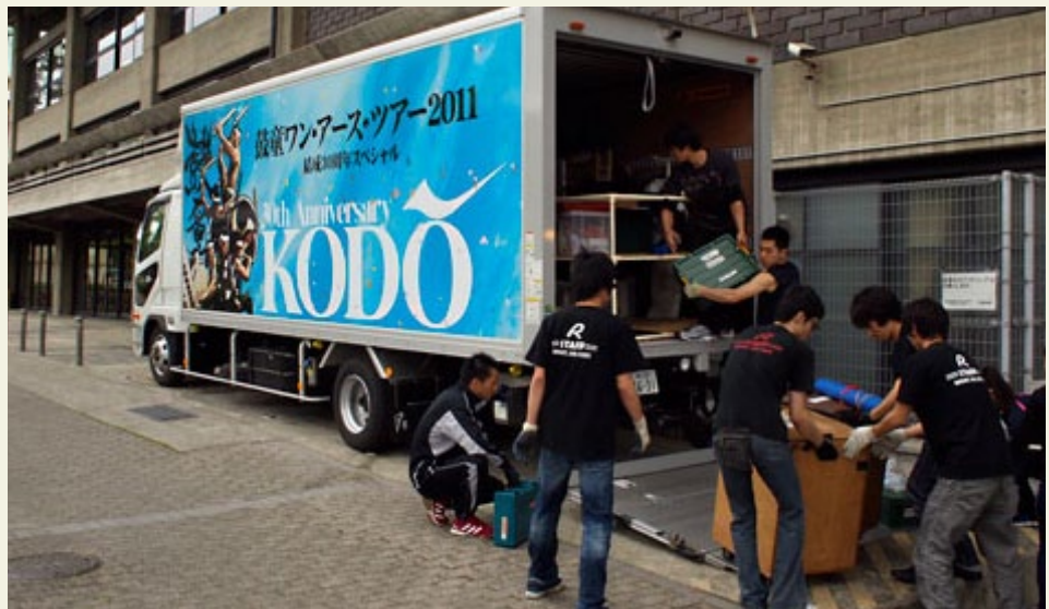
Unloading our truck on the morning of a performance. We need all day to set up all the instruments and lighting, to rehearse and warm up in preparation for an evening performance.