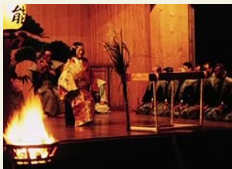
A Takigi Noh performance by torchlight

southern region one area has a dance which involves two demons. In the central part of Sado, there is a style where one demon dances with two lions ( shishi ), which is known as Shishi Oni Daiko .