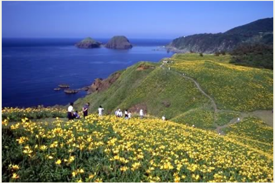
Visitors stroll among kanzo (wild day lilies) in Sado's northern coastal region

As in much of Japan, many households on Sado Island keep a vegetable garden and at this time of the year the rows are filling with cabbage, turnips, carrots, onions and more. Some of these vegetables are eaten fresh, while others will be pickled and preserved for use during the winter.