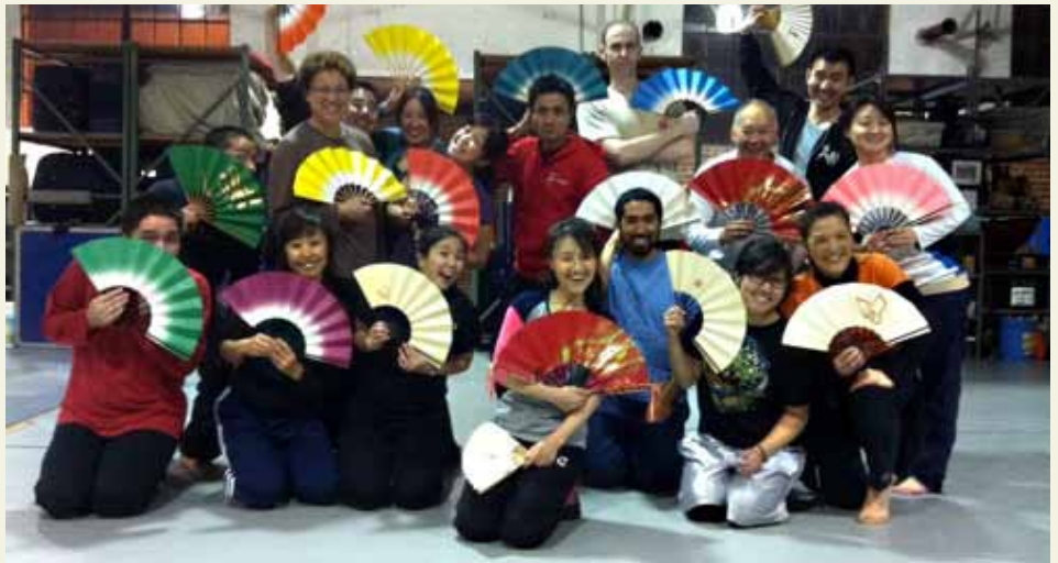
With San Jose Taiko members after a dance workshop