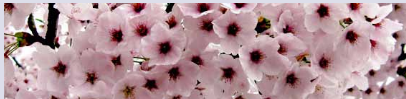
Sakura (cherry blossoms), Sado Island.