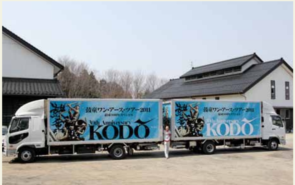
Takeshi Arai with our brand new Kodo trucks, all ready for the domestic tour

To everyone in Tokyo and the surrounding areas, we'll see you soon too. We're bringing all the power we can muster to help recharge everyone's spirits.