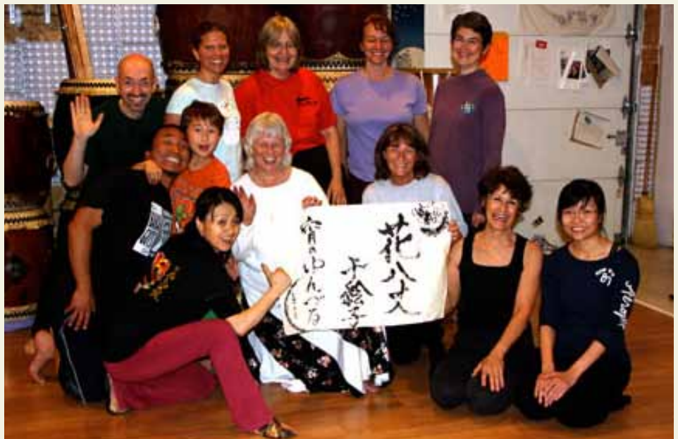
With Fushicho Daiko, Phoenix, Arizona