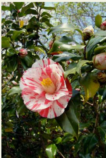
Camellia japonica in bloom at Earth Celebration's main concert venue Shiroyama Park, Ogi, Sado Island

Feedback Topics you'd like to see? Stuff you can't find? Problems with the PDF? We want to know! Kodo eNews Feedback