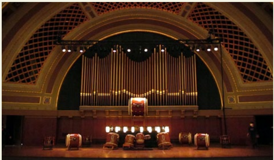
Our taiko on stage in Ann Arbor