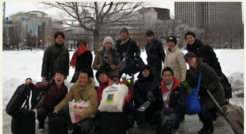
Heading to the theater in snowy Ottawa