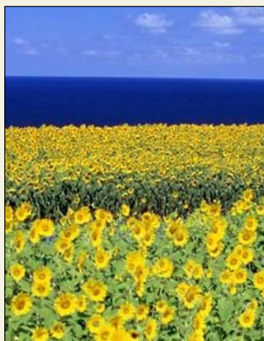
Sunflowers by the sea. Ogawa, Sado Island.

Feedback Topics you'd like to see? Stuff you can't find? Problems with the PDF? We want to know! Kodo eNews Feedback