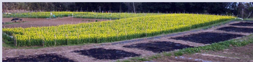
Springtime garden. Ogi Peninsula, Sado Island.