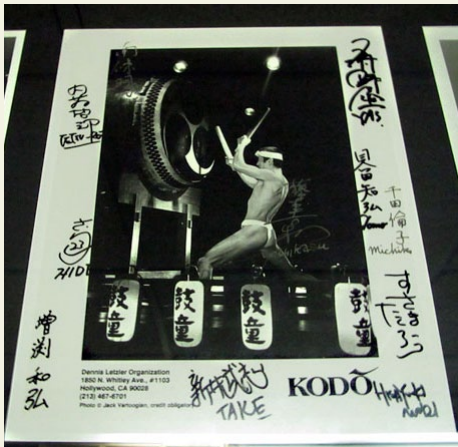
Backstage in Ottawa, a signed Kodo photograph from 17 years ago in 1994