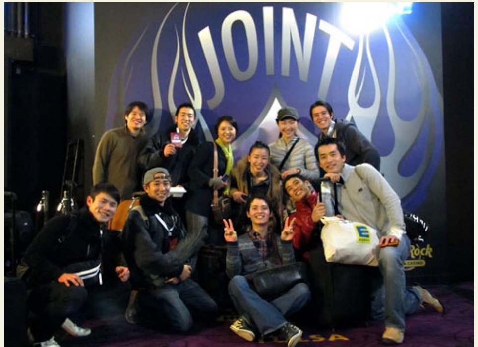
At the brand new Hard Rock Casino, Tulsa, OK