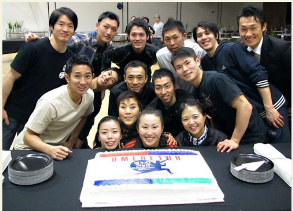
With the stunning cake at the Kodo 30th Anniversary Reception in Los Angeles, CA