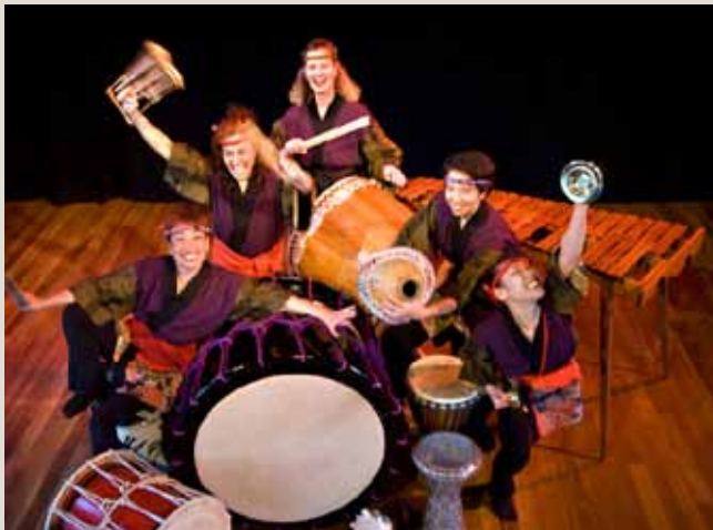
Maze Daiko of Alameda, California

Island to Island Arts Festival Friday, March 4, 2011, 8:00 pm Saturday, March 5, 2011, 8:00 pm