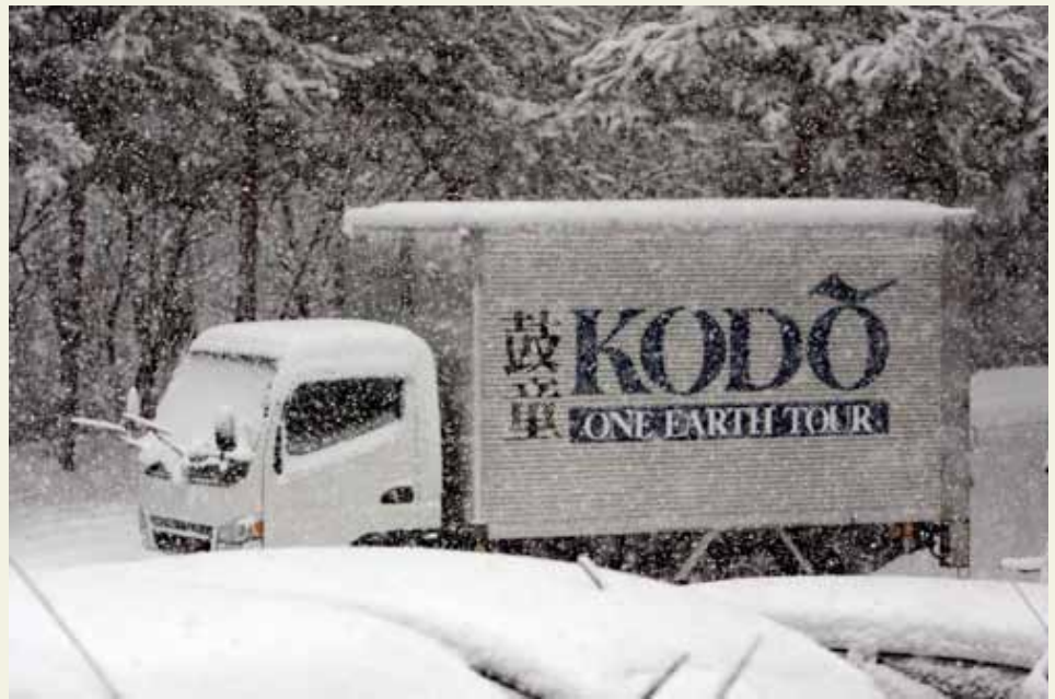
A tour truck waits patiently outside the Rehearsal Hall beneath a blanket of new snow

"The Sea of Japan in winter. I was brought up on the Pacific Ocean side of Japan (Yokohama), so for me the wild waves of the Sea of Japan in winter can be summed up in just one simple word: cool. You can see the same sea from mainland Honshu, but one special thing about living on Sado is being able to experience the tremendous Sea of Japan.