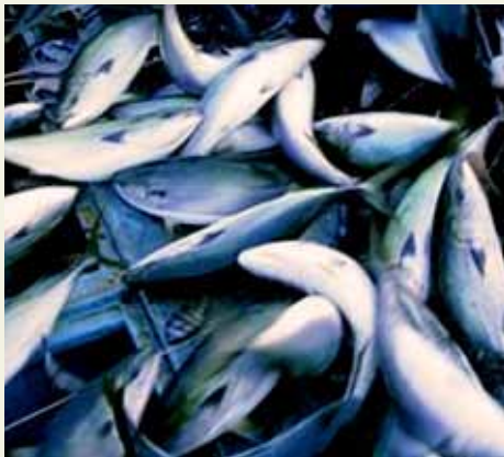
Freshly caught winter yellowtail (kanburi)

“Spring, summer and autumn are all really feel-good seasons for running on Sado. Now it is the middle of winter, the temperatures are below zero, and the snow is piling up. Kodo Village in particular is in a very windy place, so I am running in blizzards. It is so much fun, with no cars and no people on the road, it’s just me, struggling alone down the middle of the road in these conditions.” Shin’ichi Sogo , a.k.a. Shinchan-sensei , staff