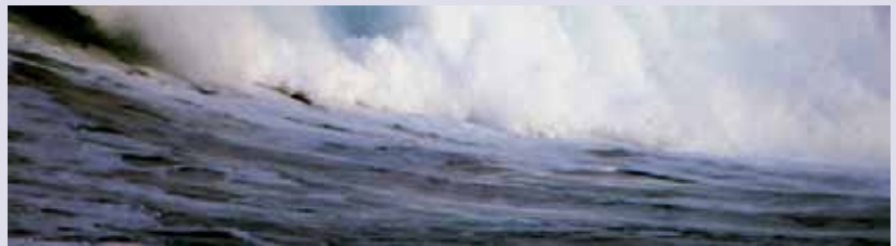
Stormy seas. Ogi Peninsula, Sado Island