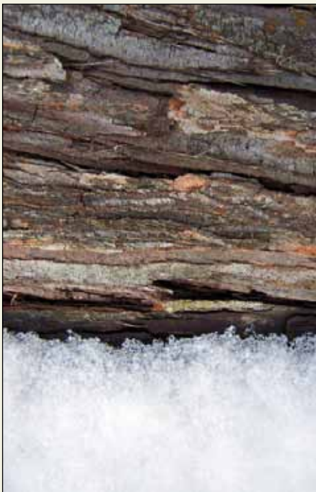
Snow rests against the bark of Sado Island cedar.

Feedback Topics you'd like to see? Stuff you can't find? Problems with the PDF? We want to know! Kodo eNews Feedback