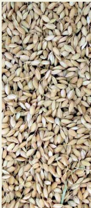
Fresh grains of rice from Sado's Kuninaka District await husking

Feedback Topics you'd like to see? Stuff you can't find? Problems with the PDF? We want to know! Kodo eNews Feedback