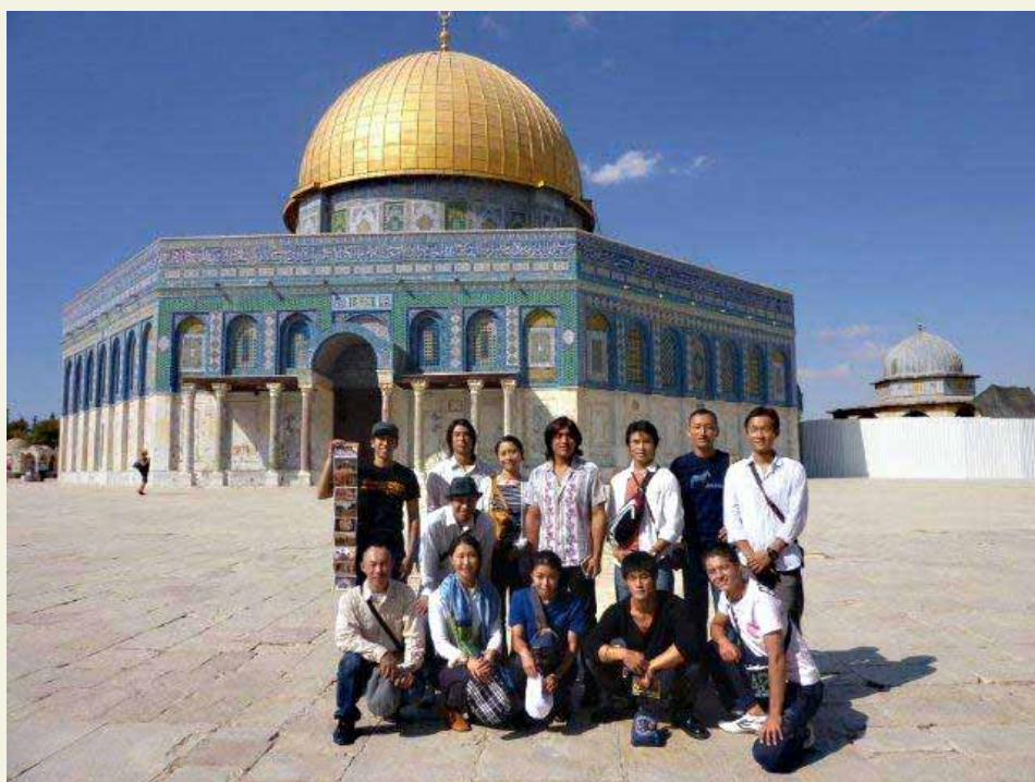
Kodo OET members by the Dome of the Rock, an Islamic shrine located on the Temple Mount in Jerusalem