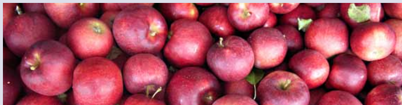
Sado Island apples