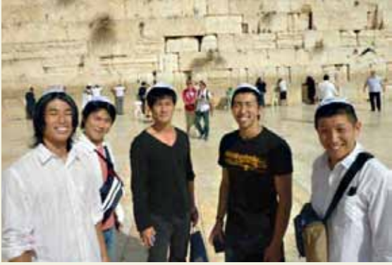
In front of The Western Wall (or "Wailing Wall") in Old City of Jerusalem

Tomohiro: OET Photos continued from page 2