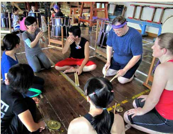
Groups of apprentices and participants collaborate to make a fun arrangement to the KASA/MIX song & dance “Issshoni” (Together)

Please note that this workshop tour is not held annually. To be informed when the next one is planned, please send your contact details to KASA Email: kodoarts@earthlink.net