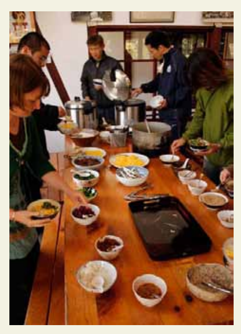
Lunch at Kodo Village: prepared by members, using fresh, seasonal, local ingredients

Living, Learning, and Creating Since 1971, when Kodo's antecedent group Sado no Kuni Ondekoza was formed, Sado Island has been our home and the platform from which we reach out to the world. With nature's warm embrace evident in each of her four seasons, Sado is an extraordinary place where traditional ways of life and the island's inherent performing arts still thrive today. This island is the fountain of our inspiration and