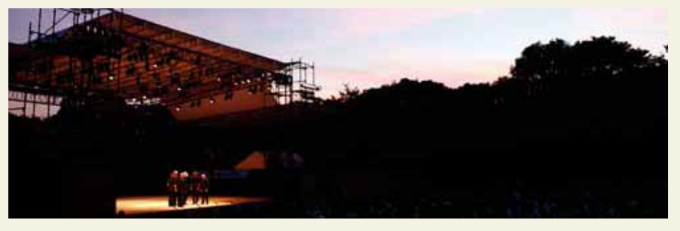
Soothing sounds and stunning skies. A Filetta made their Japan debut at EC