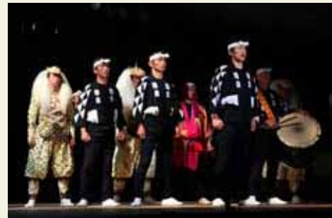
"Kumo-no Namiji" by Kodo, at home on Sado Island