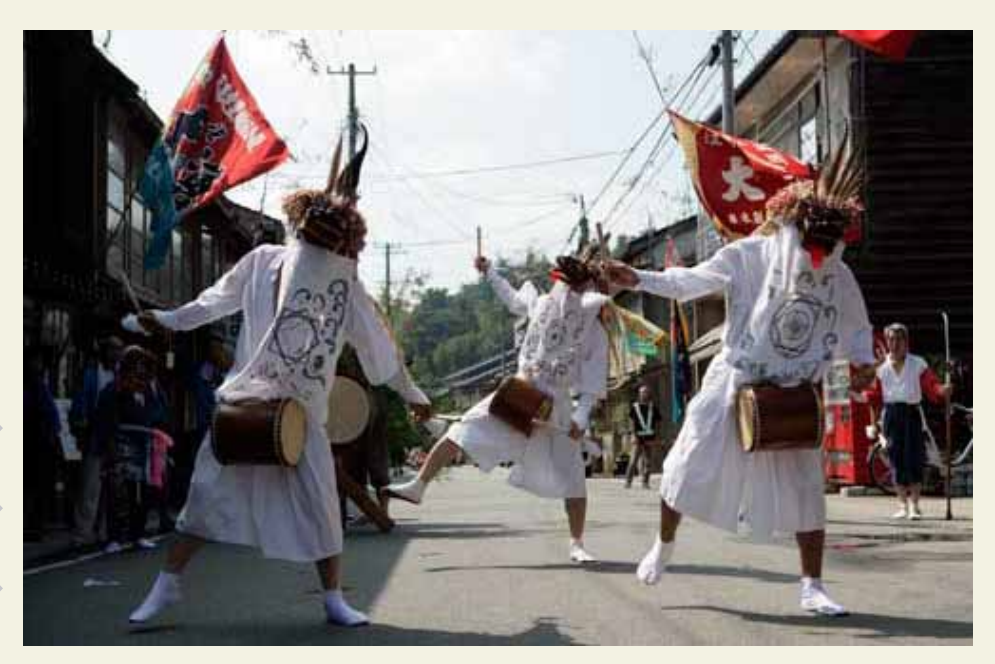
Special Fringe Event featuring Sado Performing Arts included the Kojishimai Deer Dance from Takachi in Aikawa