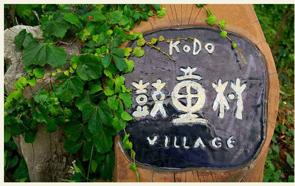
Sign at the entrance to Kodo Village, Sado Island, Japan. The lives of fifty Kodo members are centered here.

the guiding force behind our creative lifestyle.