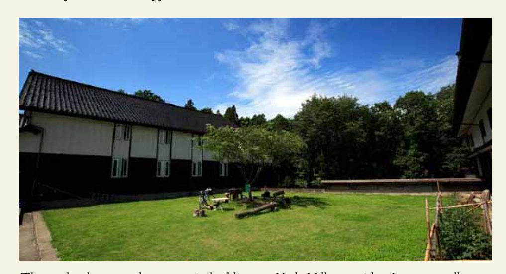
The garden between the two main buildings at Kodo Village, with a Japanese zelkova (keyaki) planted in the center. This tree, planted in March 2001, reminds us how many years it takes for a tree to grow big enough to make a drum. We wonder how Kodo will have evolved by the time this tree is fully grown.