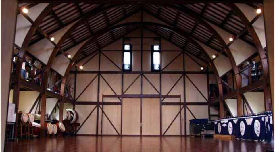
Kodo Village Rehearsal Hall