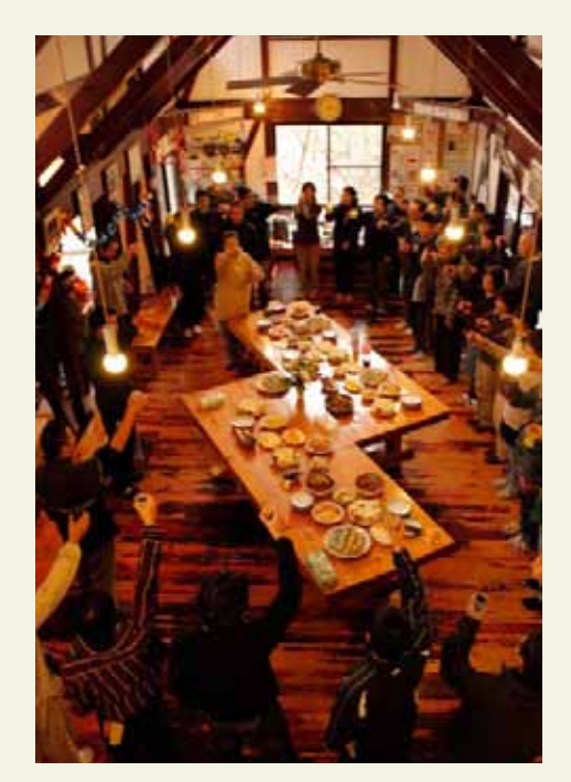
Kodo Village Dining Room

In 1988, Kodo built its own village base not far from the original schoolhouse by the sea, with living, practice, recording and office spaces, farm land and carefully tended forests. The lives of 50 Kodo members from throughout Japan are centered in this village.