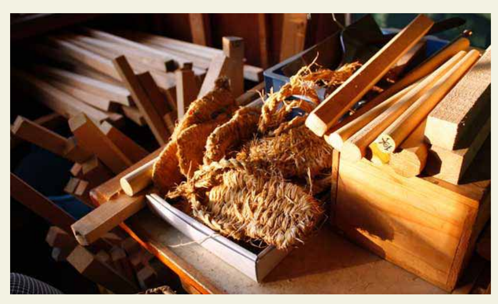
Wood waiting to be made into drumsticks, with handmade straw sandals, in the workshop at the Kodo Apprentice Centre