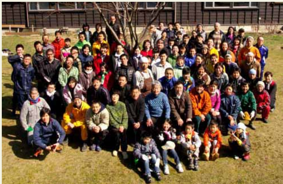
The Kodo group, complete with 12 new apprentices, gathered for the annual Kodo Villager's Event on April 4th, 2010.