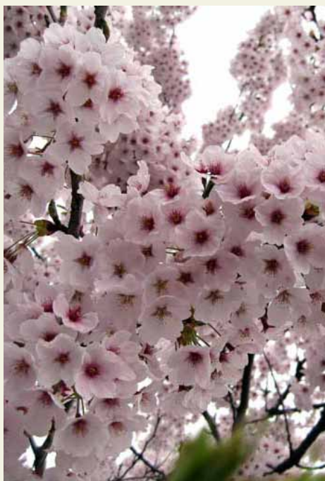
Cherry blossoms of Spring on Sado