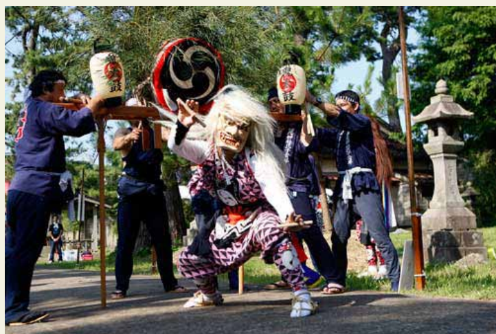
Sado Performing Arts display - Demon Drumming at Earth Celebration

Every September, they host the "Rencontres de Chants Polyphoniques de Calvi" festival on Corsica where artists from around the globe join them for multicultural collaborations. Providing a rare occasion for reciprocal island festival performances, this year A Filetta has returned Kodo's invitation to EC with an invitation to be their first Japanese guest artists at the 2010 "Rencontres."