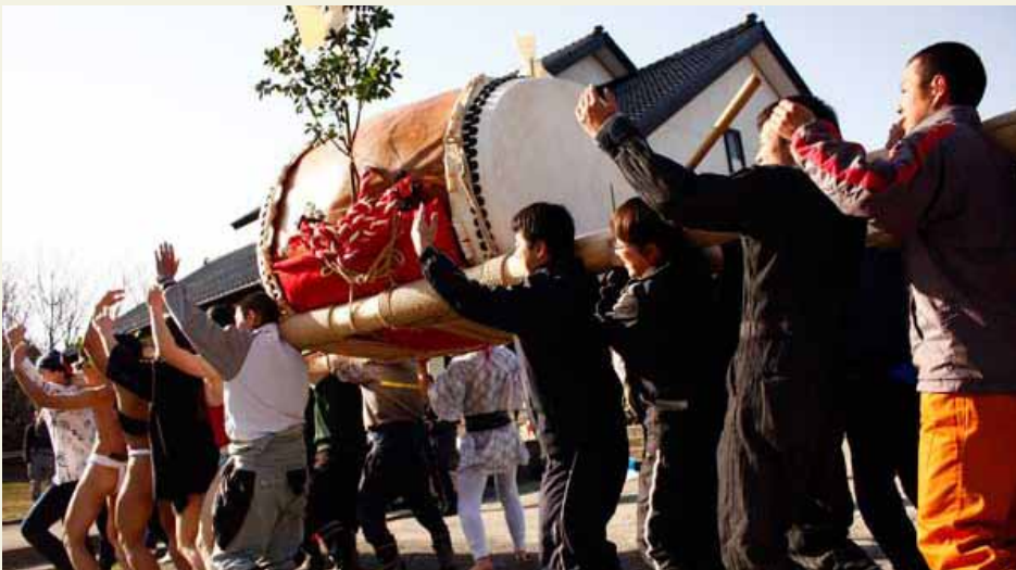
When this taiko drum, nicknamed Spuddy, is carried around the village, it's all hands on deck. It weighs a hefty 450kgs (992lbs) alone, and the logs and ropes he rests on only add to the load.