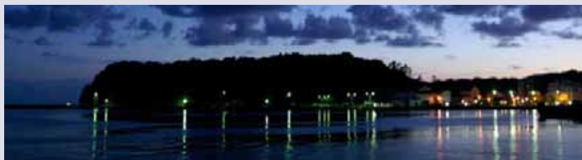
Shiroyama Park, venue of Earth Celebration, rises above Ogi Port on Sado Island