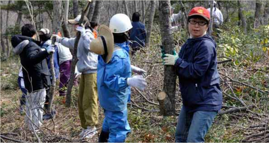
The annual “pass-the-branch” relay to clean up the Kodo Village forest and stockpile firewood for next winter.