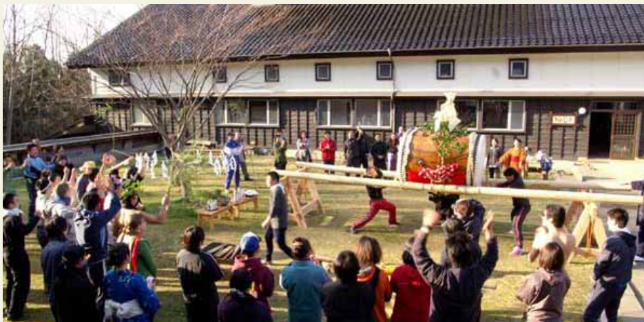
Everyone at Kodo Village plays the big drum in turn, hoping for a fruitful and healthy year ahead, travelling Japan and the globe with taiko.