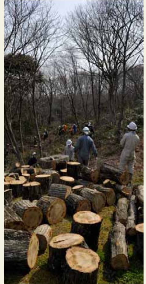
Winter's firewood pile