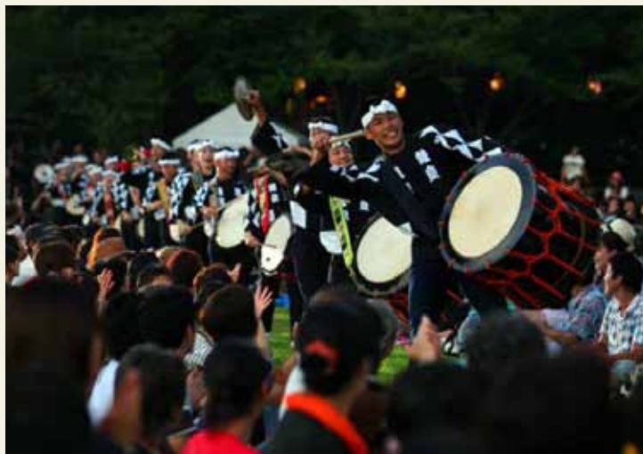
Kodo performing at Earth Celebration, at home on Sado Island