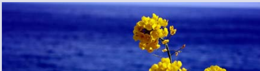
Spring flowers by the sea, Sado Island