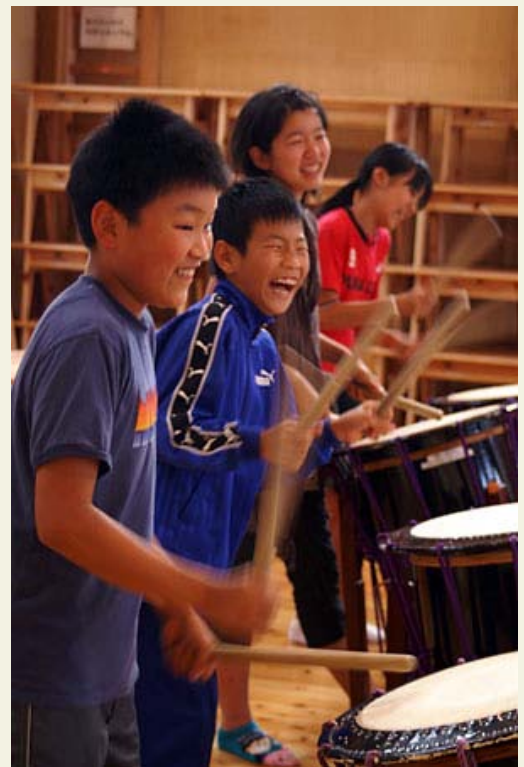
At the Sado Island Taiko Centre, playing the taiko is serious fun

2011: Kodo will celebrate its milestone 30th anniversary. We are planning tours in North America and throughout Japan next year.