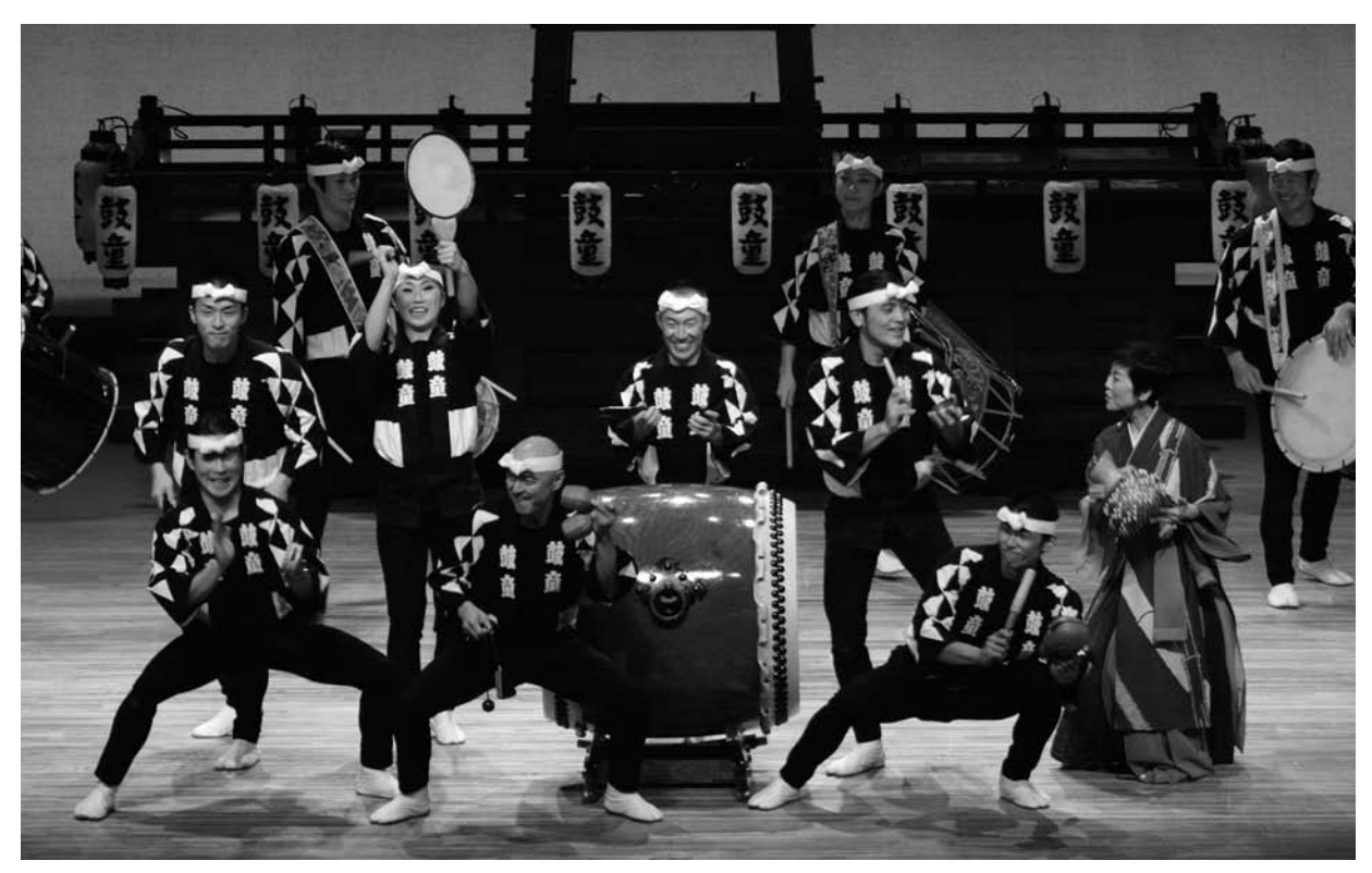
Kodo performing 'Sora'

We want to thank you for your continued support and wish you a wonderful 2011 from Sado Island.