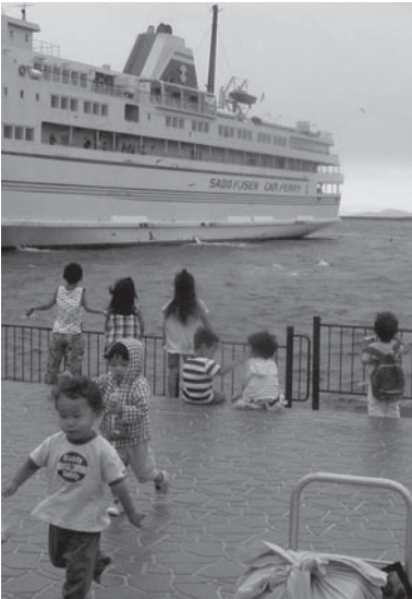
Where friends are made. Note the mainland visible 50 km away (top right) in spite of the rainy weather and stormy seas.

show as they can. Will this be the day Kodo holds an early morning guerrilla performance there? If you have signed up for a workshop you might spend the morning there, if not, maybe it's time to mosey over to the market for a mid-morning snack or decide what to have when lunch time arrives. Fringe performances will have begun by now so you head back with friends to Kisaki shrine to seek the shade of the towering pines, kick back in the grass and listen to performers from around the world compete for attention with the skirling cicadas.