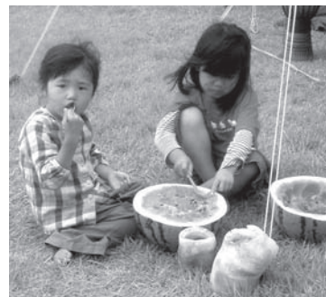
Life don't get much better than this.

wander the streets and alleys of Ogi and get as close as you can to what old Japan felt like, short of visiting a heritage site like Gifu's Takayama – which though