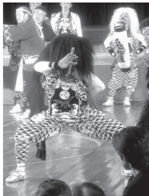
A Taste of Sado Island with an Ondeko (Demon Drum Dance) group.

To you the reader who lives somewhere other than Sado Island, coming to the EC must seem a welcome trek to the back of beyond to get away from it all. For those of us who live on Sado it is a time when our