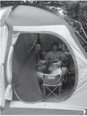
Even local people camp out to experience a different side of the place they have chosen to live.

Japan drift down from the mountain nearby. After the concert the revellers descend to the market for cold drinks, hot food, music and lamp-lit re-hashings of the day's events. Impromptu drumming circles form and telephone numbers exchanged. Here you bump into so and so from Tokyo who comes every summer and meet