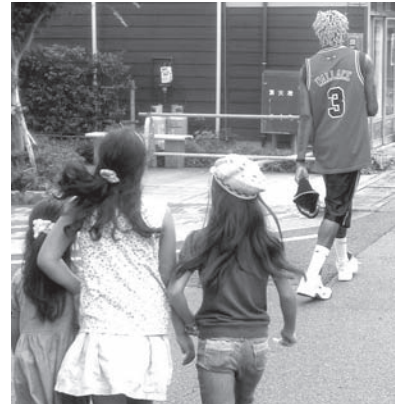
3 young fans stalk one of the players from Brazil's 'Olodum' in the streets of Ogi.

that is the spring on our internal clocks winding down, loosening, adjusting to the dream-like pace that is EC. A 3 day break from running for trains, we drift in a delicious haze from one gentle experience to another. The cognoscenti line up at the crushed-ice parlour for a frosty time-slip into Showa-era memories. We