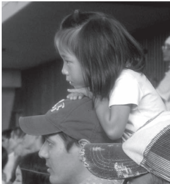
Something for everyone at the Fringe

'The shwarma truck isn't back!' 'Never mind, I found an even better one run by a Turkish guy over there!'