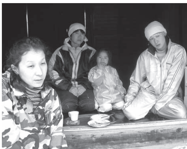
The Ikeno's keeping a watchful eye on Kodo's wrangling.