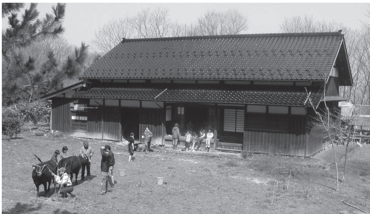
Kikuko & Fuyumi visiting Izumi Tei, the 200 year old (originally thatched) Sado farmhouse rebuilt at the village and used as an all-purpose space.

We begin the day with self-introductions at 9 o'clock. Then we set to work. We break up into groups. This year our cow Kikuko (see KB 84) and her friend Fuyumi are visiting for the first time so we have one group looking after them for the day. Another large group gathers wood that has already been cut for burning in the woodstove in the dining room. Another group splits and stacks logs. We won't be cutting trees today because we want it to be a quiet time for the new members to go through the woods and get acquainted with the lay of the land and to see what flowers are blooming. Right now there are some quite rare yukiwariso (primroses) to see. This land was originally used for growing trees for charcoal, so it's mostly hardwood, Japanese oak, and the like. We can burn pretty much anything except pine which exudes pitch and can cause problems with the stove. We only have one stove at the moment so we can easily provide