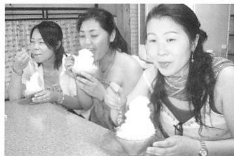
Cooling off the natural way, part II. Ogi's classic ice parlour.