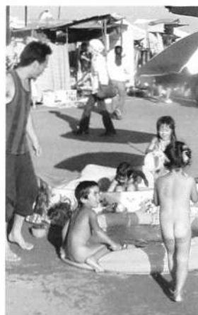
Cooling off the natural way, part I.