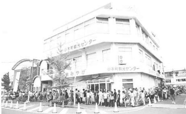
The rush is on for the 20th Anniversary rush seats.