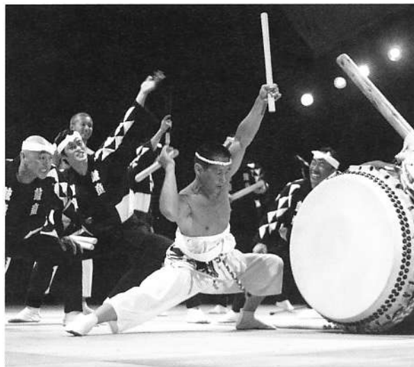
The original Miyake drummers show how it's done.

People from all over the world gather here on Sado and walk up the slope of Shiroyama where they find Kodo. Surrounded by trees, the taiko arouse our primitive emotions. We brush against the spirit of Earth Celebration and the artists too - who come from all over the world - feel proud to be taking part.