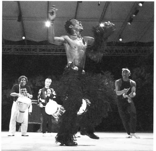
Tamango takes flight.

It is great to see how the mood of Earth Celebration changes for me from one year to another. I see how intimate it can be and the many other possibilities it opens up.