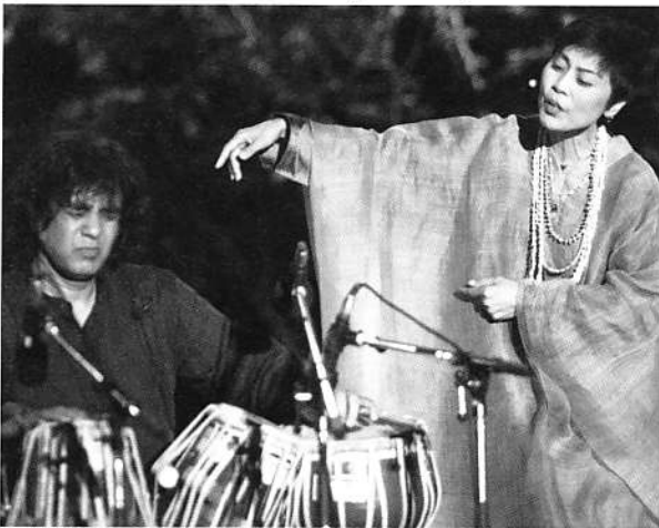
East Meet East. Zakir Hussain & Kodo's Yoko Fujimoto blend India & Japan.

20 years have passed, so now I recognize only a few of Kodo's older members. But Kodo hasn't changed their way since the beginning. I hope both EC and Kodo will continue to stay that way into the future.