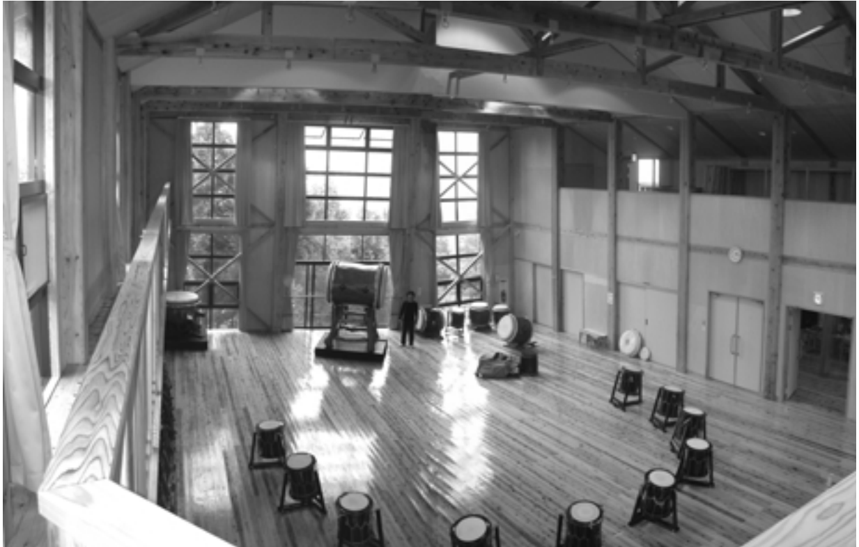
Shinichi Sogo - the centre's main man - in a rare moment of quiet in the Taiko Hall