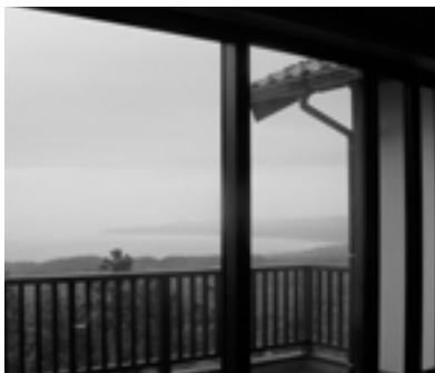
Great view of Mano Bay from the 2nd floor balcony ... even on a rainy day.

15 minutes by car from the port of Ogi (and even closer to a wonderful sandy beach) there are only two houses in taiko-hearing distance and both belong to Kodo members, so you can bang away without upsetting the neighbours. From its first and second story verandas the light-filled building commands a sweeping panorama of the Sea of Japan with among the best views of the sunset on Sado. There is also a gallery featuring rotating exhibitions related to taiko and traditional arts, a kitchen and tatami-matted meeting rooms available for a minimal extra charge.