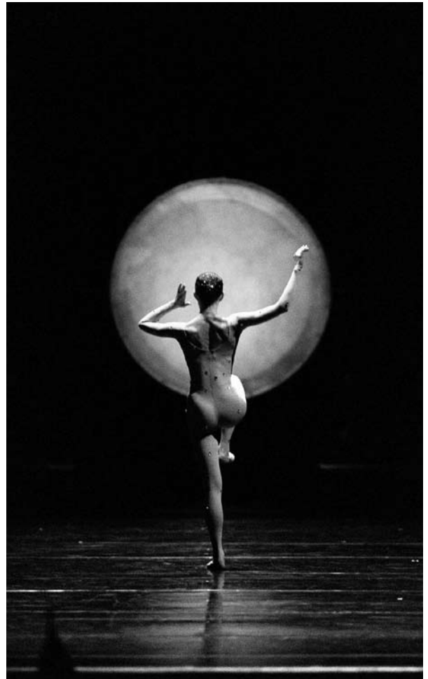
Kaguyahime as a ballet.

The suite was first performed in 1984 at the Berlin Opera House , with music performed by Kodo and the Opera Percussionists . In 1985 a version incorporating ballet made its debut featuring the Tokyo Star Dancers Ballet , Kodo and the Percussion Ensemble Okada of Japan . In 1988 Maki Ishii and Jiří Kylian joined forces to bring Kaguyahime to the next level, creating a whimsical combination of Eastern and Western art that received great critical acclaim. This show first took place at the Holland Dance Festival featuring Kodo's