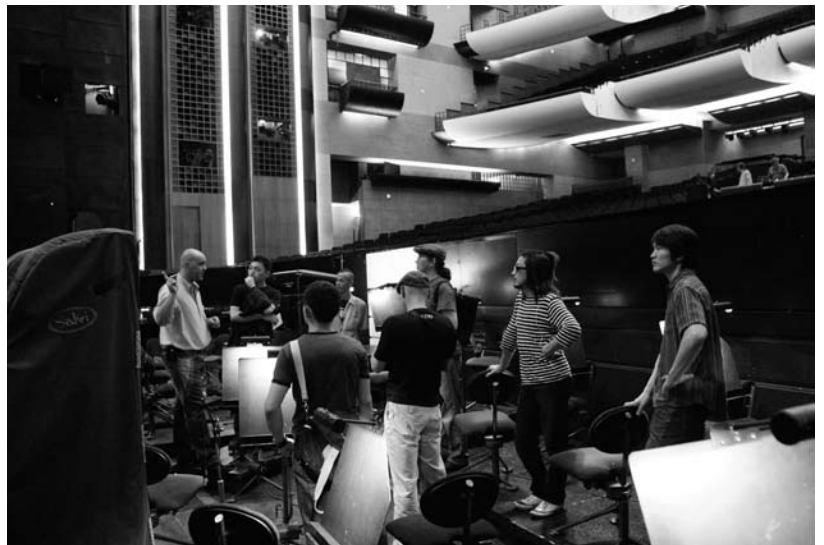
Kodo checking out the Paris Opera Bastille in 2009.

The performances will be on Friday June 11th through Thursday July 15th at the Paris Opera Bastille. If you are in the area please join us for this historic and exciting event.